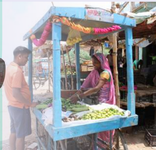
In picture: Jeera Devi Village: Shahpur Block: Warsaliganj District: Nawada

However, this was difficult. The limited quantity of vegetables I could carry made it challenging to earn a substantial income, and it consumed a significant amount of my time. I was provided with a wooden wheel cart to meet my needs, and this simple yet invaluable tool changed my life. With the wooden wheel cart, I can now cover greater distances and transport more vegetables and fruits to the village market. My daily income increased to ₹250. My health has improved, and for the first time, I am able to save money for my family's future. She says positively.