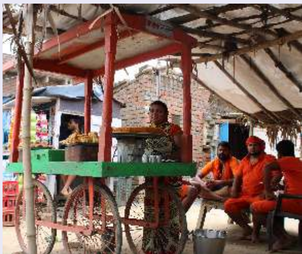
In picture: Bebi Kumari Village: Shahpur Block: Warsaliganj District: Nawada