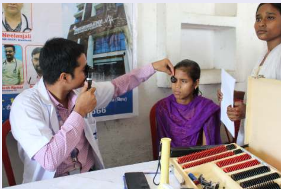
In Picture: Eye checkup in health camp Village: Dheodha Block: Pakribarawan District: Nawada

कुछ महीनों मुझे बुखार, कमजोरी और बदन दर्द था और डॉक्टर से दिखवाने के लिए दूर जाना पड़ता था क्योंकि गांव के पास कोई अस्पताल नहीं है। इसमें पैसा खर्च होता है, सब कमाई तो इलाज में लग जाता था। गांव में स्वास्थ्य शिविर लगने से बहुत सुविधा मिला है। I learned about a health camp organized in my village through the dedicated efforts of volunteers of HRDP and VDC. With their guidance and support, I decided to attend the health camp. At the health camp, I received much-needed medical attention and essential medications. The volunteers and healthcare professionals at the camp were compassionate and attentive, addressing my immediate health concerns. However, they also recognized the severity of my condition and the need for more comprehensive care. Upon their recommendation, I was referred to a nearby Primary Health Centre (PHC), where I could receive the further medical attention I required. Today, I am enjoying a healthier and happier life. She says with hope in her eyes.